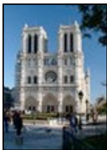
Notre Dame Cathedral

Day 3: Morning tour of the Louvre Museum- we can arrange for a guided group tour or a private experience. And why not try Lunch at Café Marly in the Museum itself ? Or if morning is not your thing, we can arrange this for the afternoon.