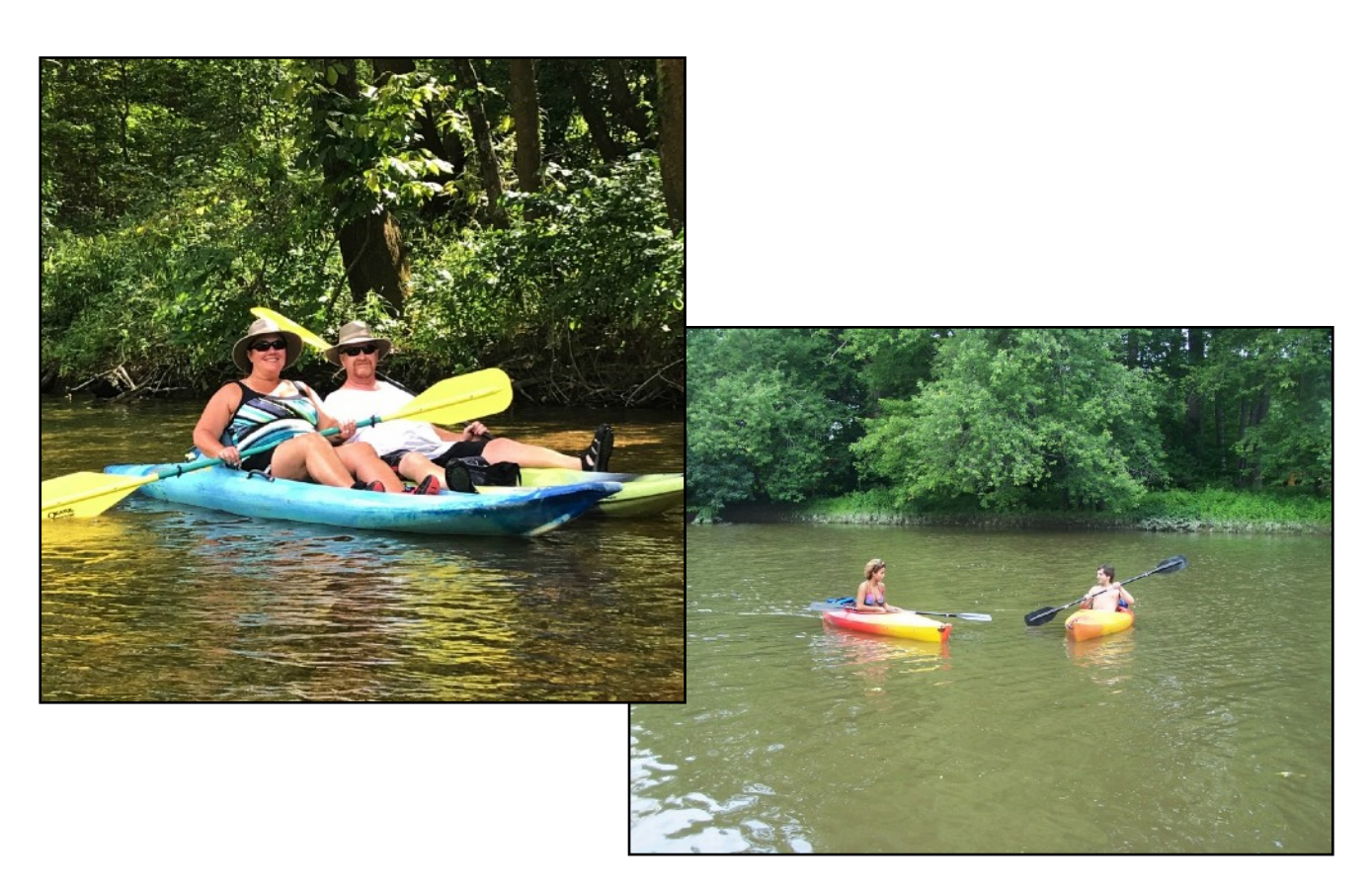
Safari Float on Corobici River

( B,L,D ) Breakfast at the hotel and private transfer to the Papagayo lodging located in the Costa Rica's North Pacific Coast about 3:30 hour drive. On the way, near the town of Cañas, you will stop for a safari floating tour on the scenic Corobici River. Observe the abundant wildlife that gathers in the lush vegetation along the riverbanks as you float by. During this relaxing nature safari, you will get a chance to see exotic wildlife, such as birds, monkeys and crocodiles, set against a backdrop of cattle ranches and graceful rolling hills that lead to the <u>Gulf of Nicoya</u>. After the tour, enjoy a Costa Rican lunch before continuing to <u>Papagayo</u>. Hotel check-in and balance of the afternoon at leisure. Check in for 4 nights in oceanfront beach suite.