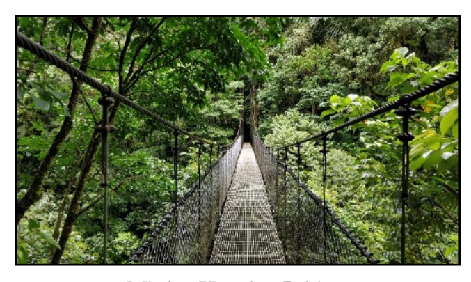
Mistico Hanging Bridges

will teach you about Costa Rican culture, history, and nature, while pointing out different species of plants, animals and birds along the way. These trails bring you as close as you'd ever hope to see the rainforest and its inhabitants, as well as give you access to see stunning views of the rainforest and mountains that are miles away. Transfer back to the hotel and balance of the afternoon at leisure